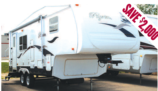
Used 2006 Pilgrim 254 RKSS Single Slide, Rear Kitchen, Jackknife Sofa Slideout, Tub/Shower, Outside Shower Sale $8,995 SUGG. PRICE: $10,995 YOU SAVE: $2,000 PAYMENTS AS LOW AS $149 A MONTH