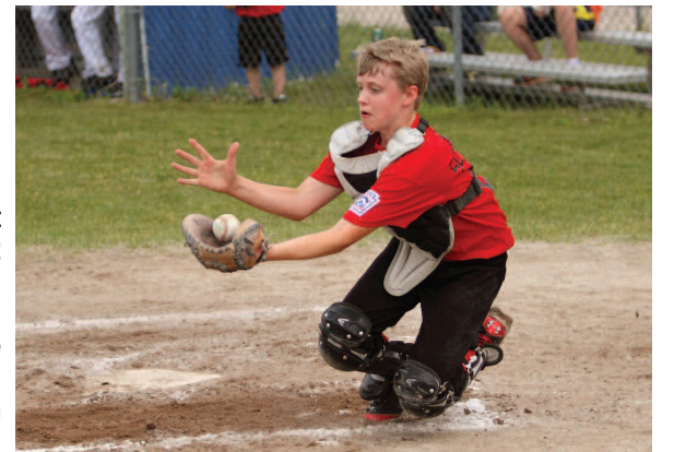
RIGHT: The East Jordan (11-12 major boys) catcher concentrates as he watches the ball into the glove on this play.