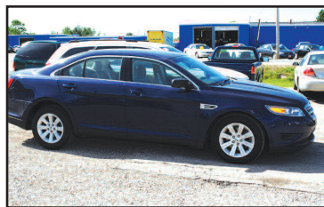
2011 FORD TAURUS Hands free phone, nice car. $239 A MONTH OR LESS