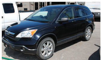
2009 HONDA CR-V AWD, great fuel economy.