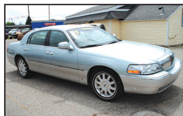
2007 LINCOLN TOWN CAR Signature Series, Leather, loaded, 99 K. SALE PRICE $11,900

TONS OF VEHICLES IN STOCK. MORE ARRIVING DAILY!