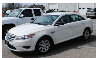
2011 FORD TAURUS Save $2,000.