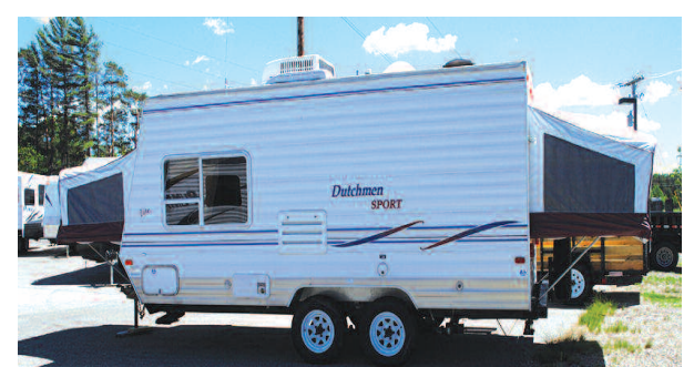
2003 Dutchman Sport Lite Travel Trailer 9 foot, 2 fold outs. Awning, leveling jacks Sale $6,995 PAYMENTS AS LOW AS $99 A MONTH