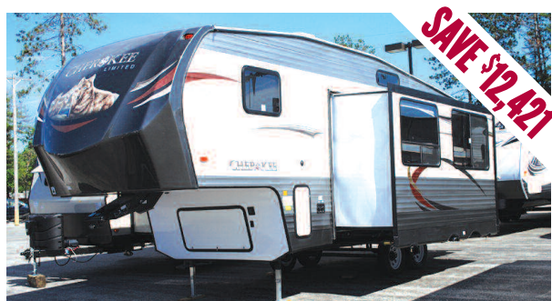
New 2014 Cherokee 235B Fifth Wheel by Forest River Single Slide, rear bunk beds, power awning, exterior shower and kitchen, power bunks, deluxe package. Great for a large family. Sale $23,995 SUGG. PRICE: $36,416 YOU SAVE: $12,421 PAYMENTS AS LOW AS $199 A MONTH