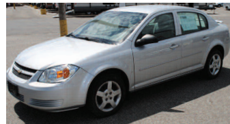
2007 CHEVY COBALT Low miles, fuel saver.