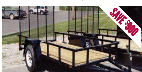
New 2014 Forest River RV Open Steel Angle Iron Trailer Open Steel Angle Iron Trailer by Forest River, 5x10 Single Axle w/Gate, 3500 LB Axle, Treated Deck, Fold Flat Rear Gate, DOT Approved Lights, Triple Angle Tongue & Much More. Sale $1,095 SUGG. PRICE: $1,995 YOU SAVE: $900 PAYMENTS AS LOW AS $69 A MONTH