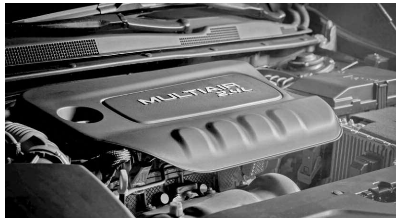
The all-new 2015 Chrysler 200 is the world's first mid-size sedan to feature a nine-speed automatic transmission, which comes standard and contributes to a fuel-economy gain of up to 13 percent compared with the outgoing car and its four-speed gearbox.

ESS works this way: - Engine controls constantly monitor vehicle speed - When the vehicle brakes to a stop, fuel flow is cut and engine