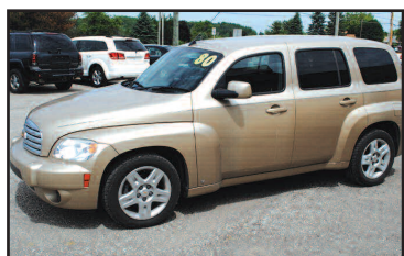
2008 CHEVY HHR LT Nice car, lots of room. SALE PRICE $7,995