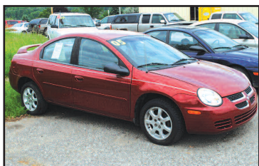
2005 DODGE NEON Auto, rear spoiler, air, cruise, auto, great MPG. S SALE PRICE $4,995

989 VFW RD., CHEBOYGAN, MI • 231-627-6700 • WWW.RIVERAUTO.NET