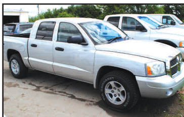
2006 DODGE DAKOTA QUAD CAB SLT 4X4 New tires, bedliner, tow pkg, V-8 Magnum. SALE PRICE $9,995