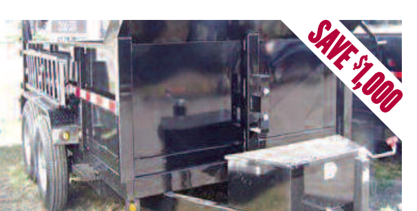
New 2014 Interstate 16.5' x 12' Dump Trailer, Griffin 68x12 Tandem Axle Heavy Duty Dump Trailer. Twin Cylinder, Powder Coated, 2 Way Gate, Heavy Duty Ramps, Monarch Pump, Interstate Battery, D Rings, Load Tarp, Much More. Sale $5,995 SUGG. PRICE: $6,995 YOU SAVE: $1,000 PAYMENTS AS LOW AS $119 A MONTH