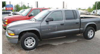
2002 DODGE DAKOTA SLT CREW CAB 4 door, low miles, rust free, bedliner, tow pkg.