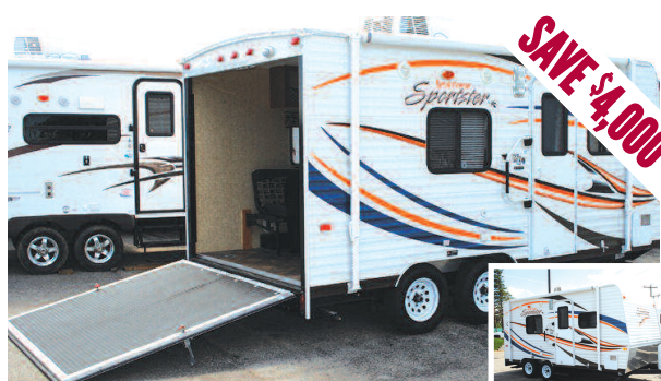
Used 2013 Sportsmen Sportster 17 foot Travel Trailer by KZ. Toy Hauler, awning. Just arrived. Sale $10,995 SUGG. PRICE: $14,995 YOU SAVE: $4,000 PAYMENTS AS LOW AS $139 A MONTH