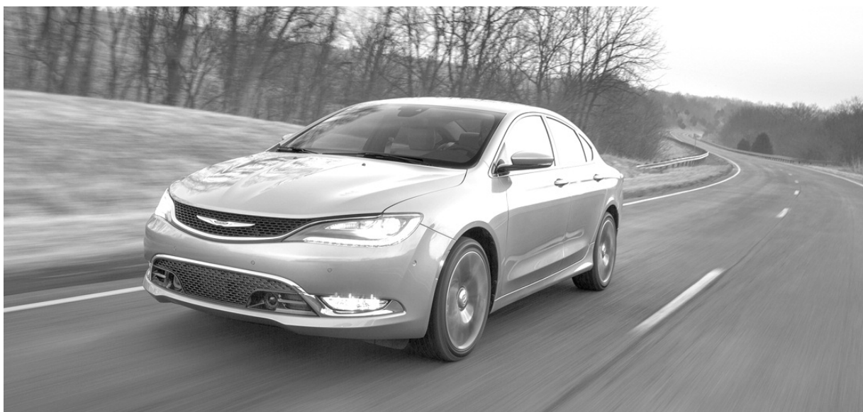
Chrysler Group is offering fuel-saving Engine Stop-Start (ESS) technology as standard equipment on certain models of the award-winning 2015 Jeep Cherokee mid-size SUV and all-new 2015 Chrysler 200 mid-size sedan.