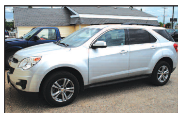
2011 CHEVY EQUINOX LT OnStar, AWD, Only 87 K. SALE PRICE $15,995