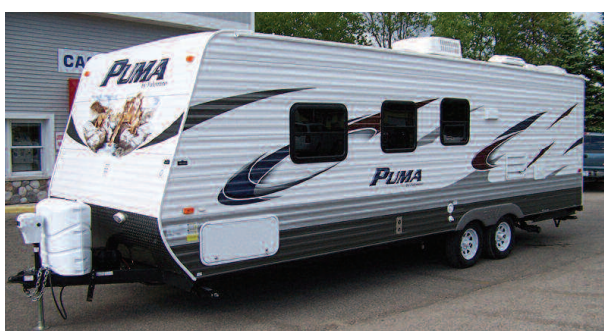
2012 Puma 27 BH Travel Trailer Just arrived. Nice unit. Sale $9,995 PAYMENTS AS LOW AS $109 A MONTH