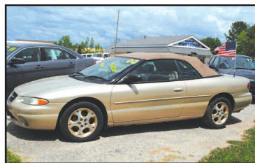
2000 CHRYSLER SEBRING CONVERTIBLE Leather. Only 76 K. SUMMER SPECIAL $4,995.