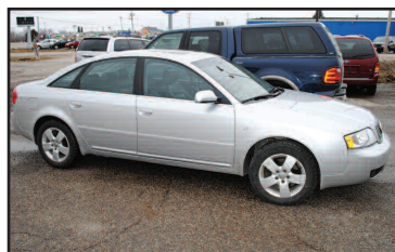
2003 AUDI A-6, 3.0 QUATTRO AWD, pwr. moonroof, dual climate control. SALE PRICE $7,995