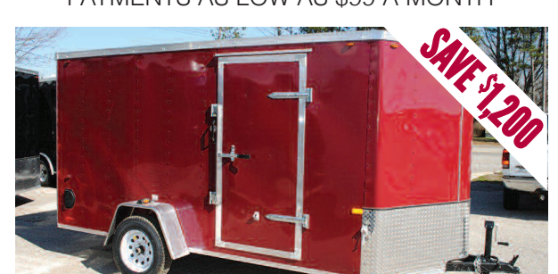
New 2014 Interstate 1 Wedge Nose 6x12 Cargo Trailers Wedge Nose Cargo Trailer by Interstate 1, Rear Ramp Door, Front Diamond Plate, 14" Platform Height, Spring Axle & Much More. Sale $2,795 SUGG. PRICE: $3,995 YOU SAVE: $1,200 PAYMENTS AS LOW AS $99 A MONTH