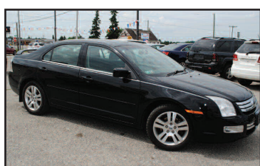
2007 FORD FUSION Nice car, great gas mileage. SALE PRICE $7,995