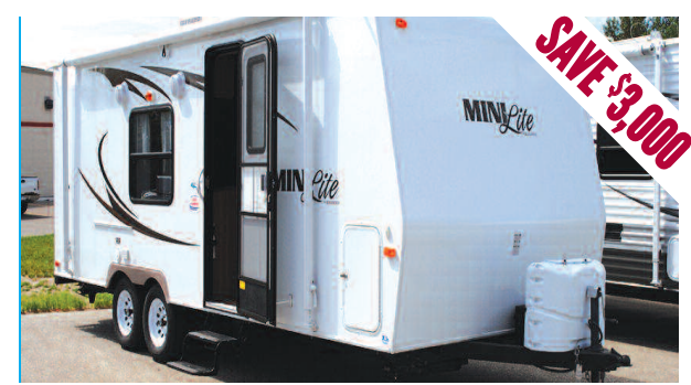
Used 2011 Mini Lite 2304 Travel Trailer by Rockwood Shower, awning. Sale $10,995 SUGG. PRICE: $13,995 YOU SAVE: $3,000 PAYMENTS AS LOW AS $129 A MONTH